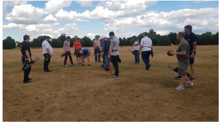
. Shown here are the shooting, the scoring and the prizes on the day.